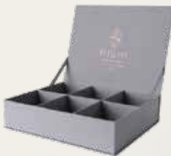
Linen Sachet Box