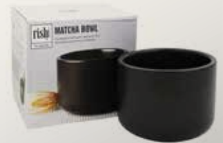
Beginner Matcha Bowl