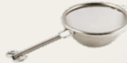
Everyday Matcha Sifter