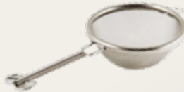
Everyday Matcha Sifter