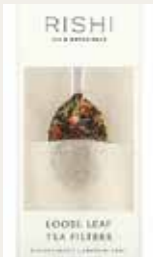
Loose Leaf Tea Bags 100ct