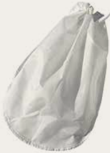
Reusable Mesh Bag