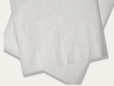
Toddy Cold Brew Commercial Filter Pack 50 paper filters plus one reusable strainer