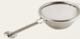
Everyday Matcha Sifter