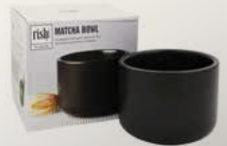
Beginner Matcha Bowl