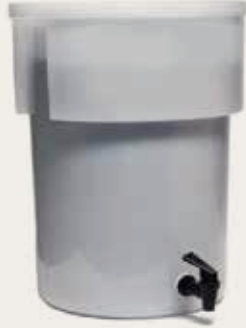
Toddy Cold Brew System Commercial Model 5-gallon toddy bucket. Uses 5lbs of coarse ground coffee