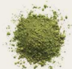
Culinary Matcha (Barista Matcha) 100g