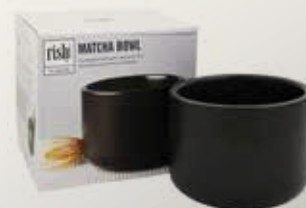
Beginner Matcha Bowl