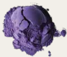
Butterfly Pea Flower Powder 100g