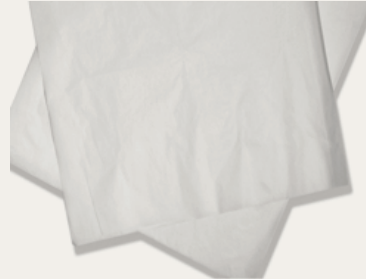
Toddy Cold Brew Commercial Filter Pack 50 paper filters plus one reusable strainer