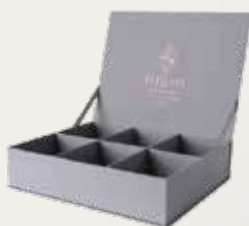
Linen Sachet Box