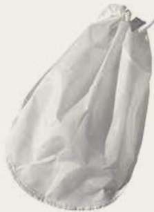
Reusable Mesh Bag