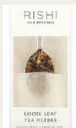
Loose Leaf Tea Bags 100ct