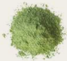
Sweet Matcha Powder 1kg