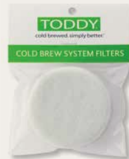
2 Pack Home Toddy Filters