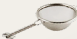
Everyday Matcha Sifter