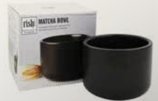
Beginner Matcha Bowl