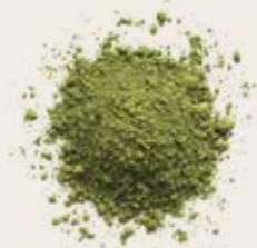
Culinary Matcha (Barista Matcha) 100g