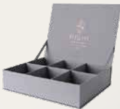
Linen Sachet Box