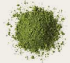
Teahouse Matcha 100g