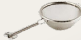
Everyday Matcha Sifter