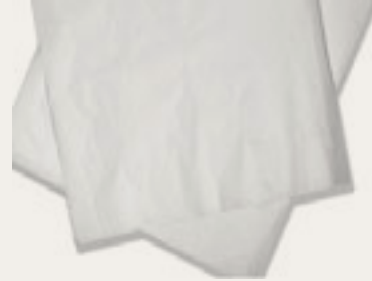
Toddy Cold Brew Commercial Filter Pack 50 paper filters plus one reusable strainer