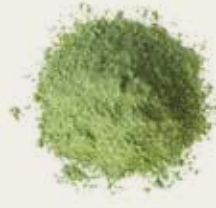
Sweet Matcha Powder 1kg