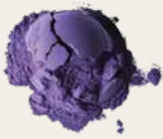
Butterfly Pea Flower Powder 100g