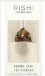
Loose Leaf Tea Bags 100ct