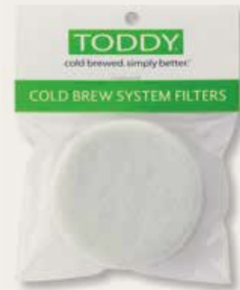
2 Pack Home Toddy Filters