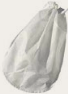
Reusable Mesh Bag