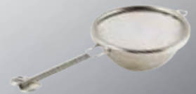
Everyday Matcha Sifter