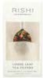
Loose Leaf Tea Bags 100ct