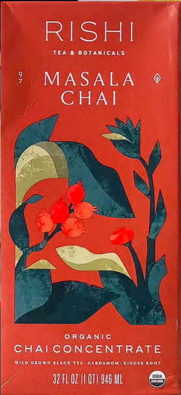
Rishi Masala Chai Concentrate 12/32oz Case