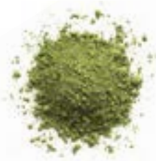
Culinary Matcha (Barista Matcha) 100g