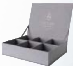
Linen Sachet Box