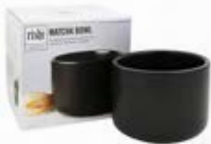
Beginner Matcha Bowl