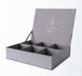
Linen Sachet Box