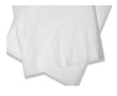
Filter Pack 50 paper filters plus one reusable strainer