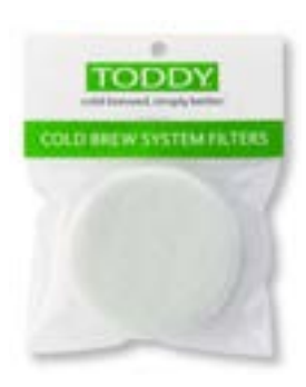
2 Pack Home Toddy Filters