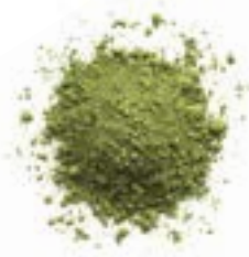
Culinary Matcha (Barista Matcha) 100g