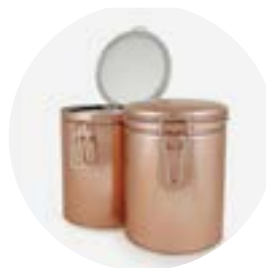
Latched Copper Tea Tin