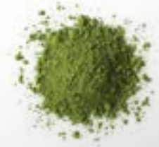
Teahouse Matcha 100g