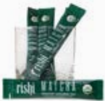
Matcha Stick Packs 16/pack