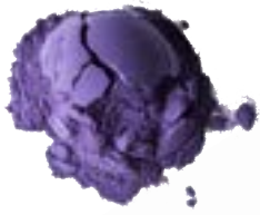
Butterfly Pea Flower Powder 100g