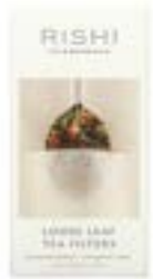
Loose Leaf Tea Bags 100ct