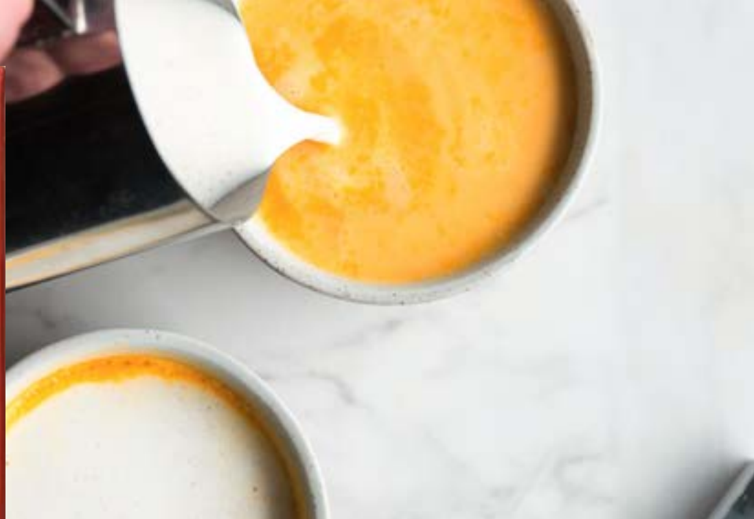
Rishi Masala Chai Concentrate 12/32oz Case