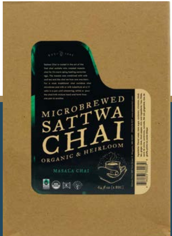
Sattwa Chai Concentrate Available 6/64oz case