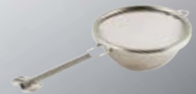
Everyday Matcha Sifter