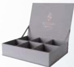
Linen Sachet Box