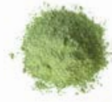
Sweet Matcha Powder 1kg