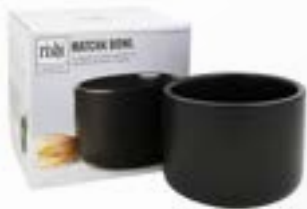
Beginner Matcha Bowl