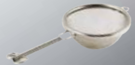
Everyday Matcha Sifter