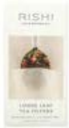
Loose Leaf Tea Bags 100ct