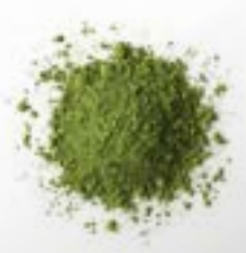
Teahouse Matcha 100g