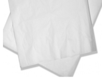
Toddy Cold Brew Commercial Filter Pack 50 paper filters plus one reusable strainer