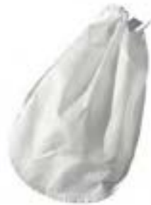
Reusable Mesh Bag