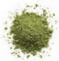
Culinary Matcha (Barista Matcha) 100g