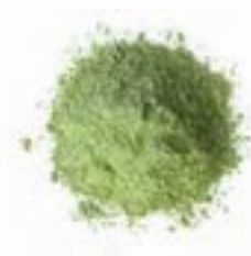
Sweet Matcha Powder 1kg