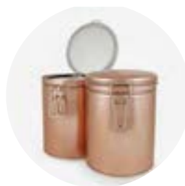
Latched Copper Tea Tin