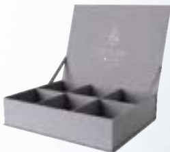
Linen Sachet Box