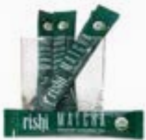
Matcha Stick Packs 16/pack