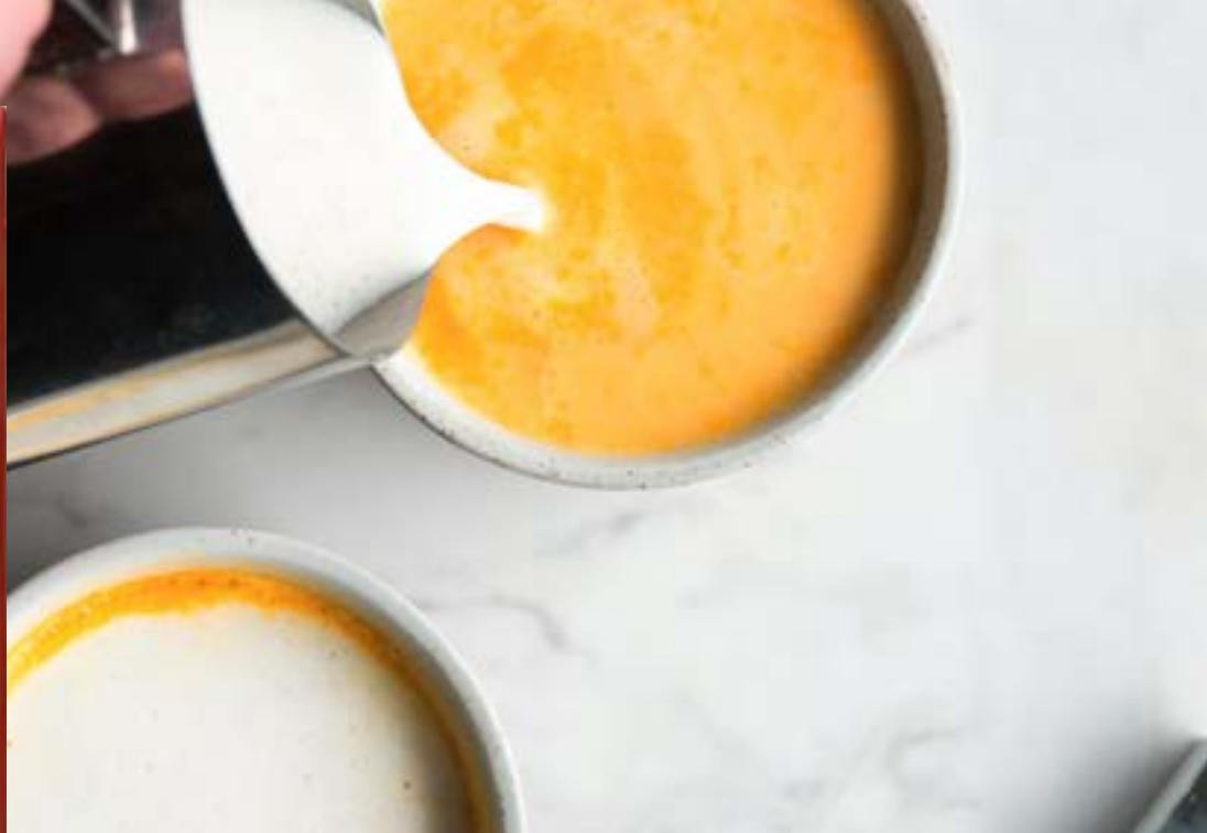
Rishi Masala Chai Concentrate 12/32oz Case