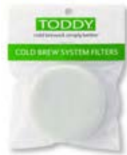
2 Pack Home Toddy Filters