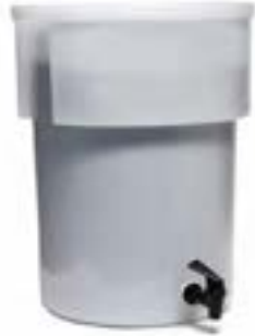
Toddy Cold Brew System Commercial Model 5-gallon toddy bucket. Uses 5lbs of coarse ground coffee