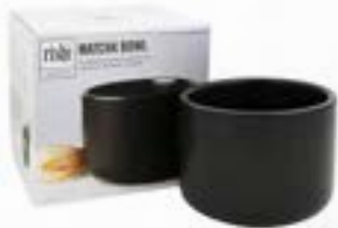
Beginner Matcha Bowl