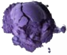
Butterfly Pea Flower Powder 100g