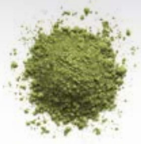
Culinary Matcha 100g