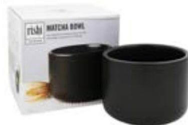
Beginner Matcha Bowl