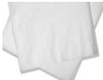
Toddy Cold Brew Commercial Filter Pack 50 paper filters plus one reusable strainer