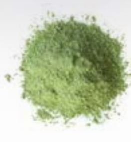
Sweet Matcha Powder 1kg