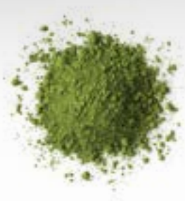
Teahouse Matcha 100g