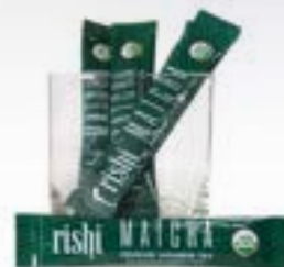
Matcha Stick Packs 16/pack