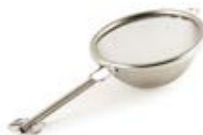
Everyday Matcha Sifter