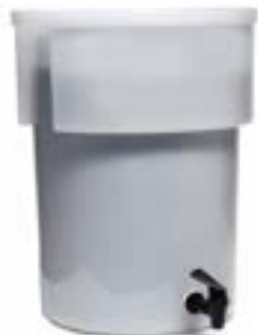
Toddy Cold Brew System Commercial Model 5-gallon toddy bucket. Uses 5lbs of coarse ground coffee