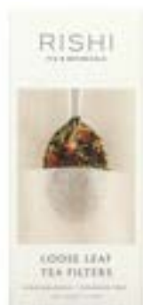
Loose Leaf Tea Bags 100ct