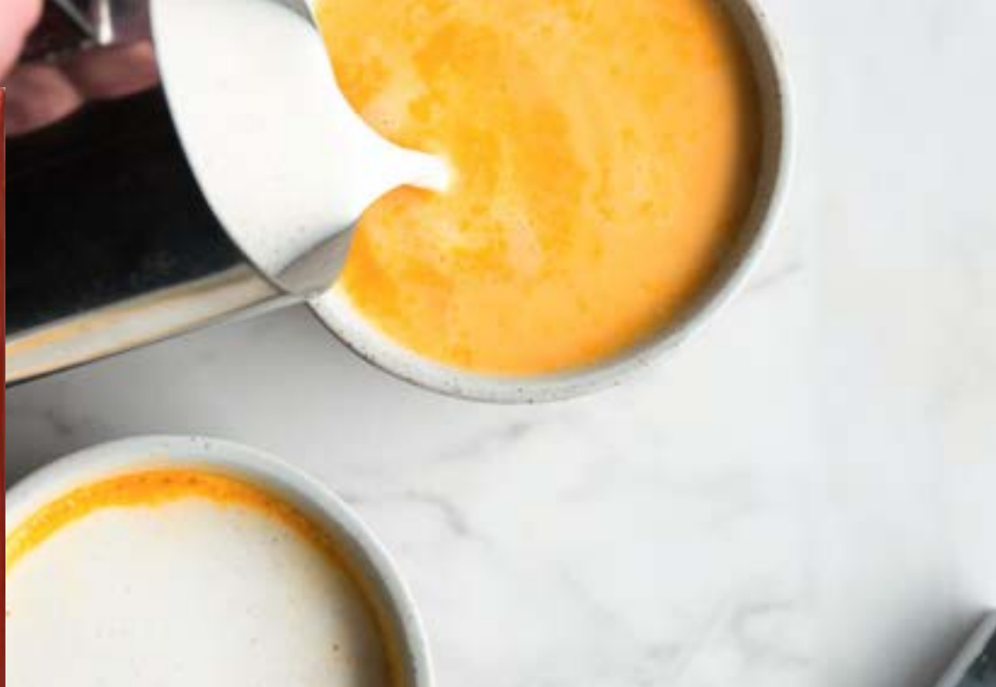
Rishi Masala Chai Concentrate 12/32oz Case