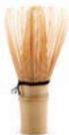
Bamboo Matcha Whisk