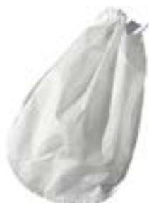
Reusable Mesh Bag