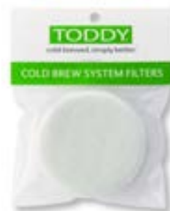
2 Pack Home Toddy Filters