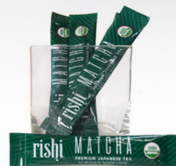
Matcha Stick Packs 16/pack