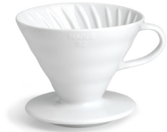
V60-02 Dripper Available in glass, ceramic, or copper