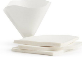
Hario White Paper Filters for 02 Dripper Buono Kettle— Aluminum 40ct or 100ct