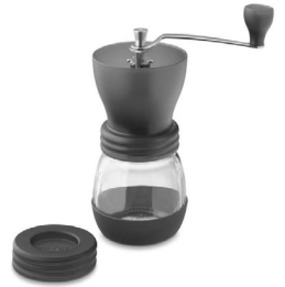
Hario Ceramic Coffee Mill Skerton