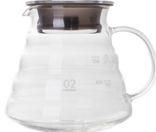
V60 600ml Range Server