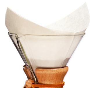
Chemex Bleached Prefolded Filter Squares 100ct.