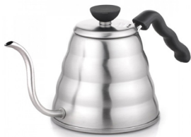
Hario Buono Water Kettle