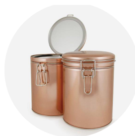
Latched Copper Tea Tin