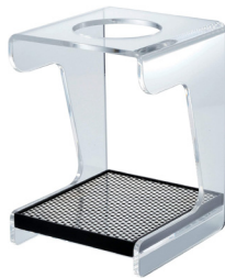
V60 Acrylic Stand with Drip Tray