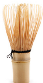
Bamboo Matcha Whisk