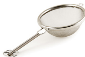
Everyday Matcha Sifter