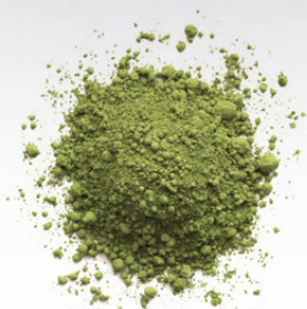
Culinary Matcha 100g