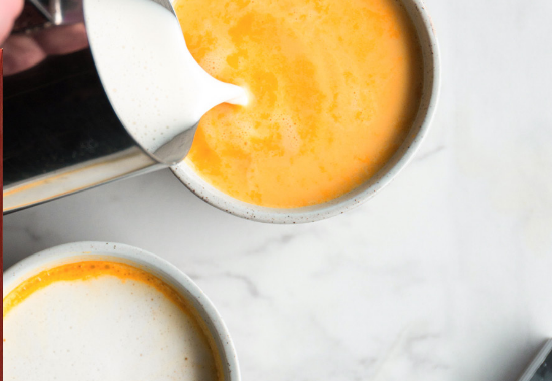
Rishi Masala Chai Concentrate 12/32oz Case