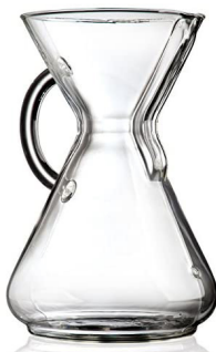
Chemex Glass Handle Available in 3 cup, 6 cup, & 10 cup sizes