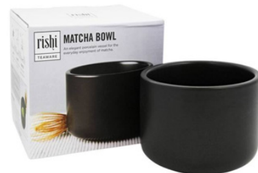
Beginner Matcha Bowl