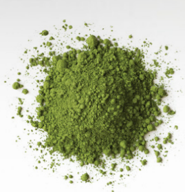
Teahouse Matcha 100g