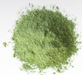
Sweet Matcha Powder 1kg