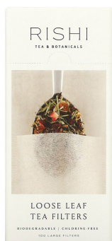
Loose Leaf Tea Bags 100ct