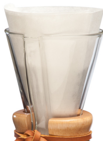
Chemex 3 Cup Half- Circle Filters 100ct.